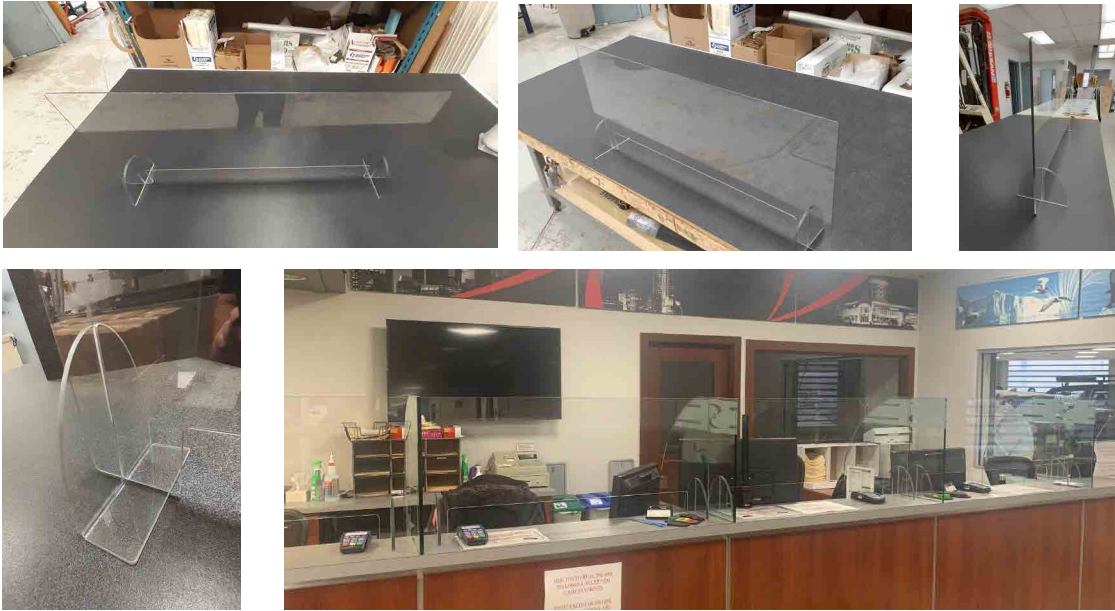
Optional bent foot